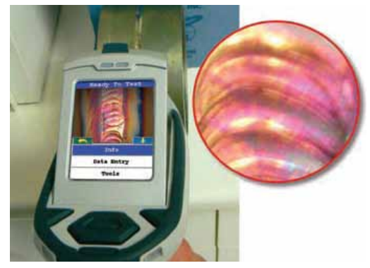
CCD camera and small-spot feature isolates and stores small sample area measurements.